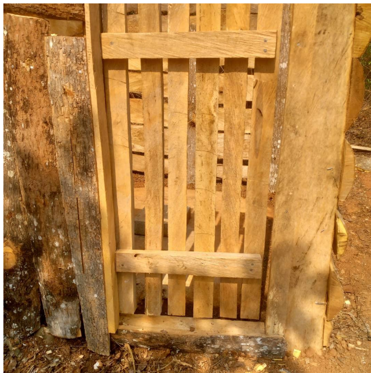
She initiated and constructed a fenced placenta pit for Bokruwa Chps Compound.