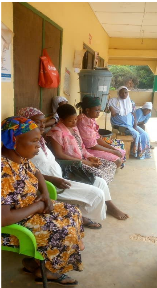
Pregnant women seated while waiting for their laboratories and scan services at Bokruwa Chps.