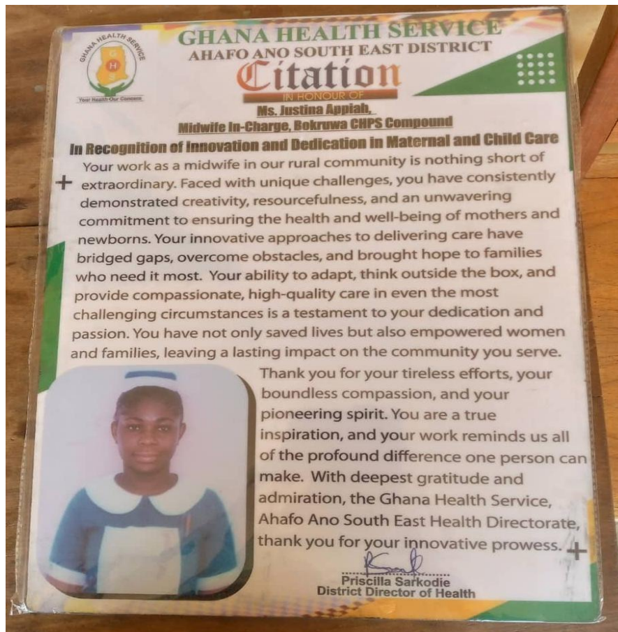
A citation given by the District Health Directorate for her immersed commitment, dedication and innovation towards maternal and child health care services at the 2024 Annual Performance Review