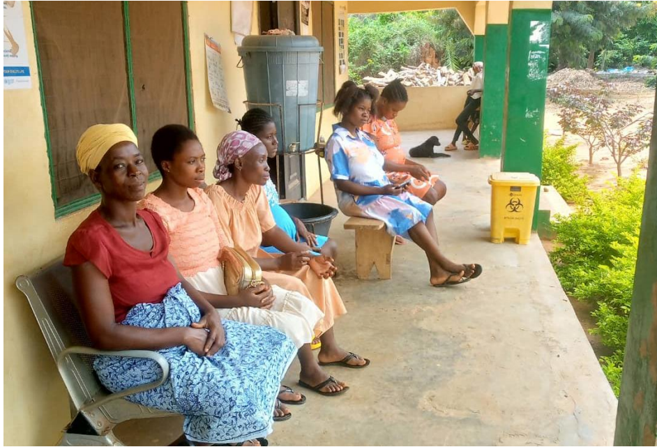
Pregnant women seated while waiting for their laboratories and scan services at Bokruwa Chps.