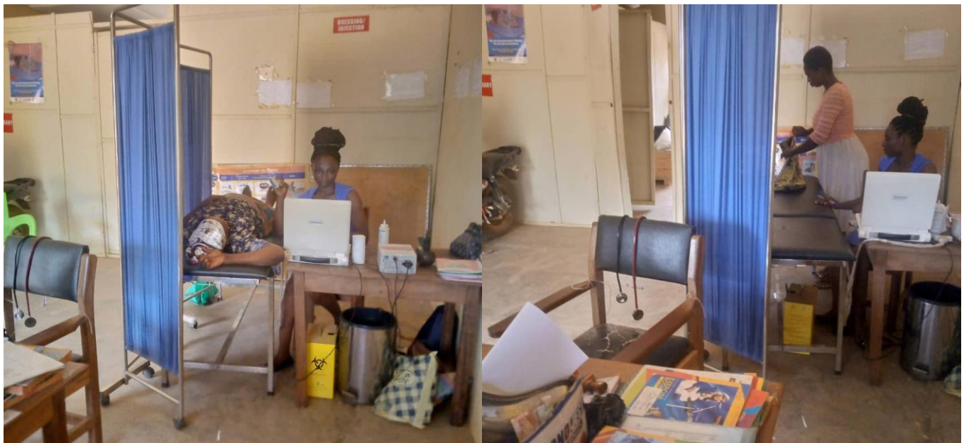
Pregnant women assessing scan services at Bokruwa Chps.