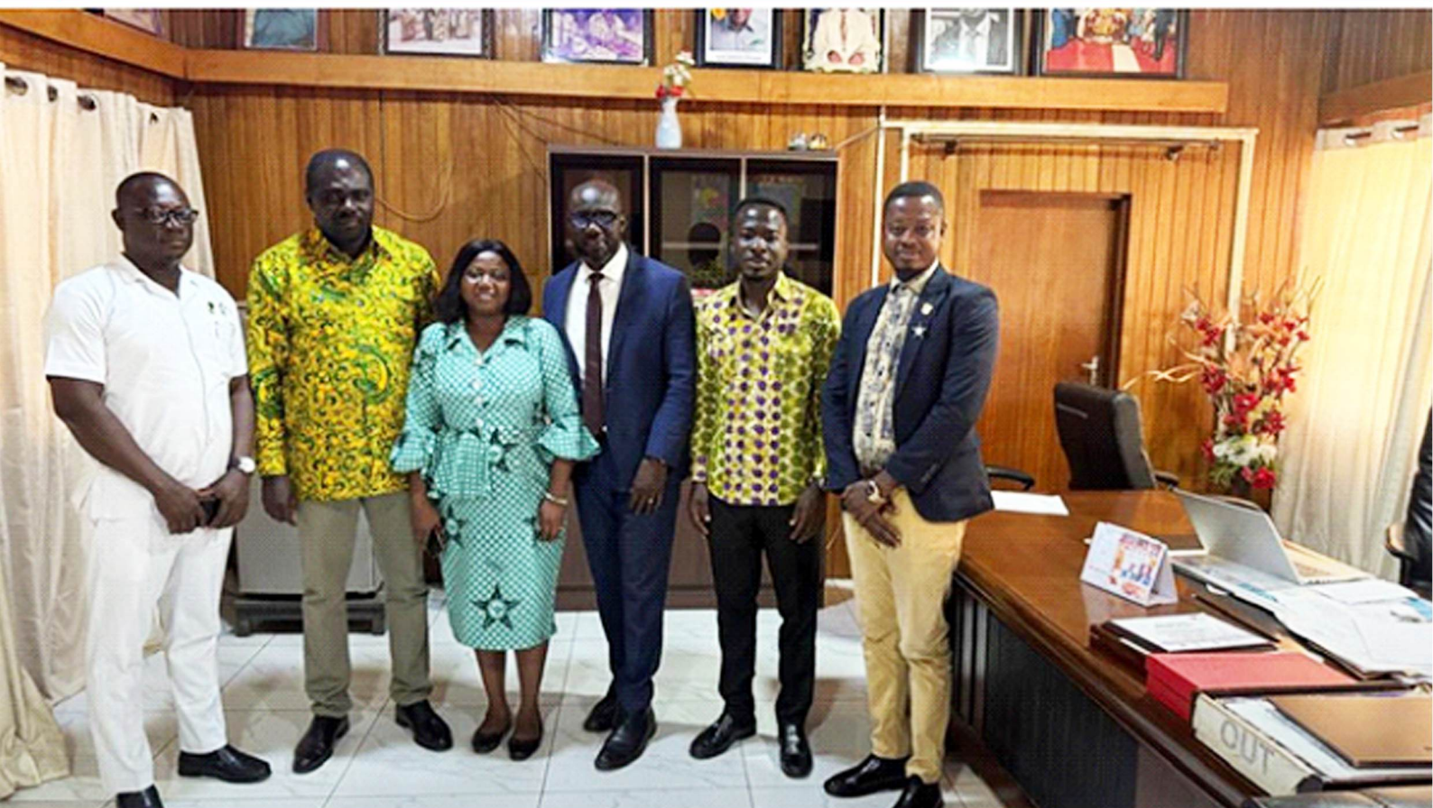
A section of the Ashanti REC members with the Regional Director of Health Service